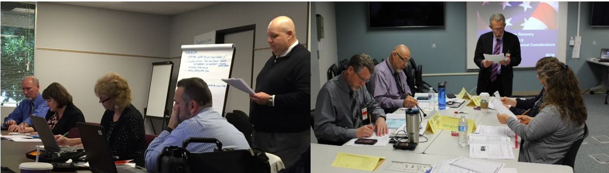
Left: Stanislaus County Chief Executive Officer discussing continuity of operations during a COOP exercise (2015). Right: Stanislaus County EOC Management Team members discuss disaster recovery concepts during training (2018).